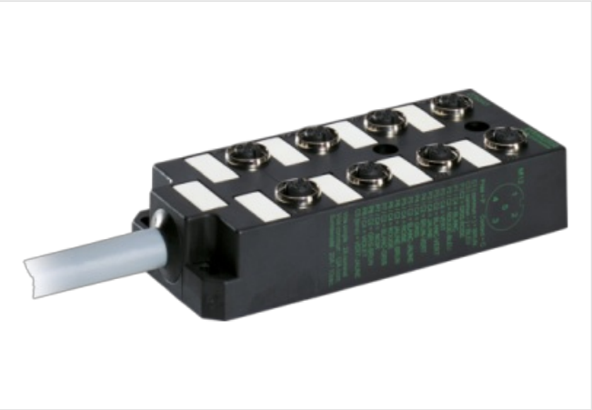
Product may differ from Image

8-way, 5-pole PUR/PVC (CNOMO) 15.0 m without LED Further cable lengths on request.